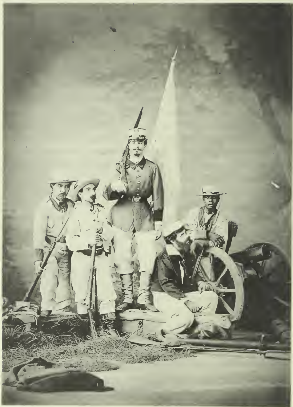
FIGURE 3.1 • Defensores de la integridad nacional (Defenders of national integrity), in Gil Gelpi y Ferro, Álbum histórico fotográfico de la Guerra de Cuba (Havana: Imprenta Militar de la Viuda de Soler y Compañía, 1870).